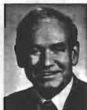
Governor Robert D. Ray

The Honorable Robert D. Ray Honorary Chairman