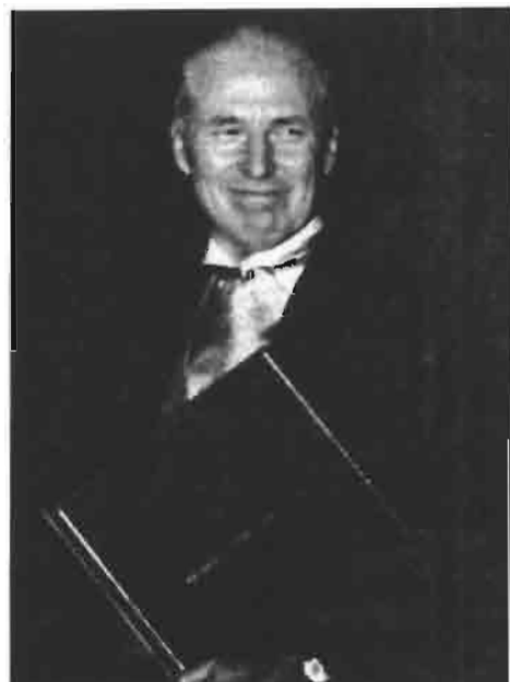
Dr. Borlaug receiving the Nobel Peace Prize in 1970.