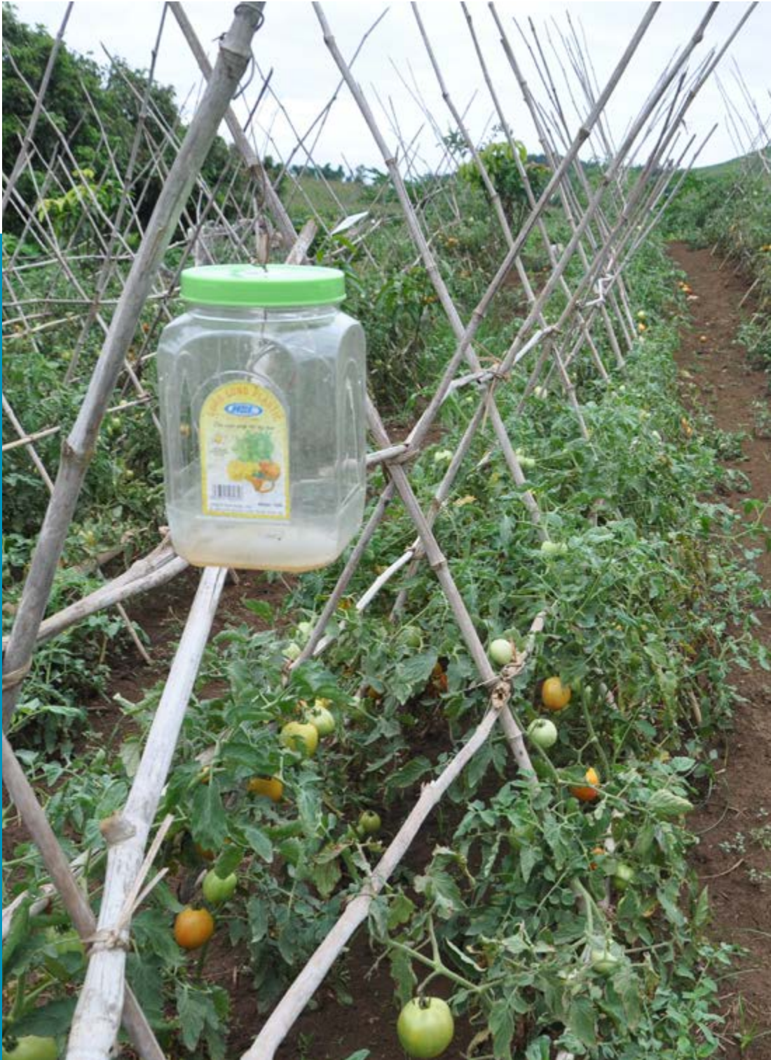
A bio-trap for home-based production of vegetables in Son La, Viet Nam.